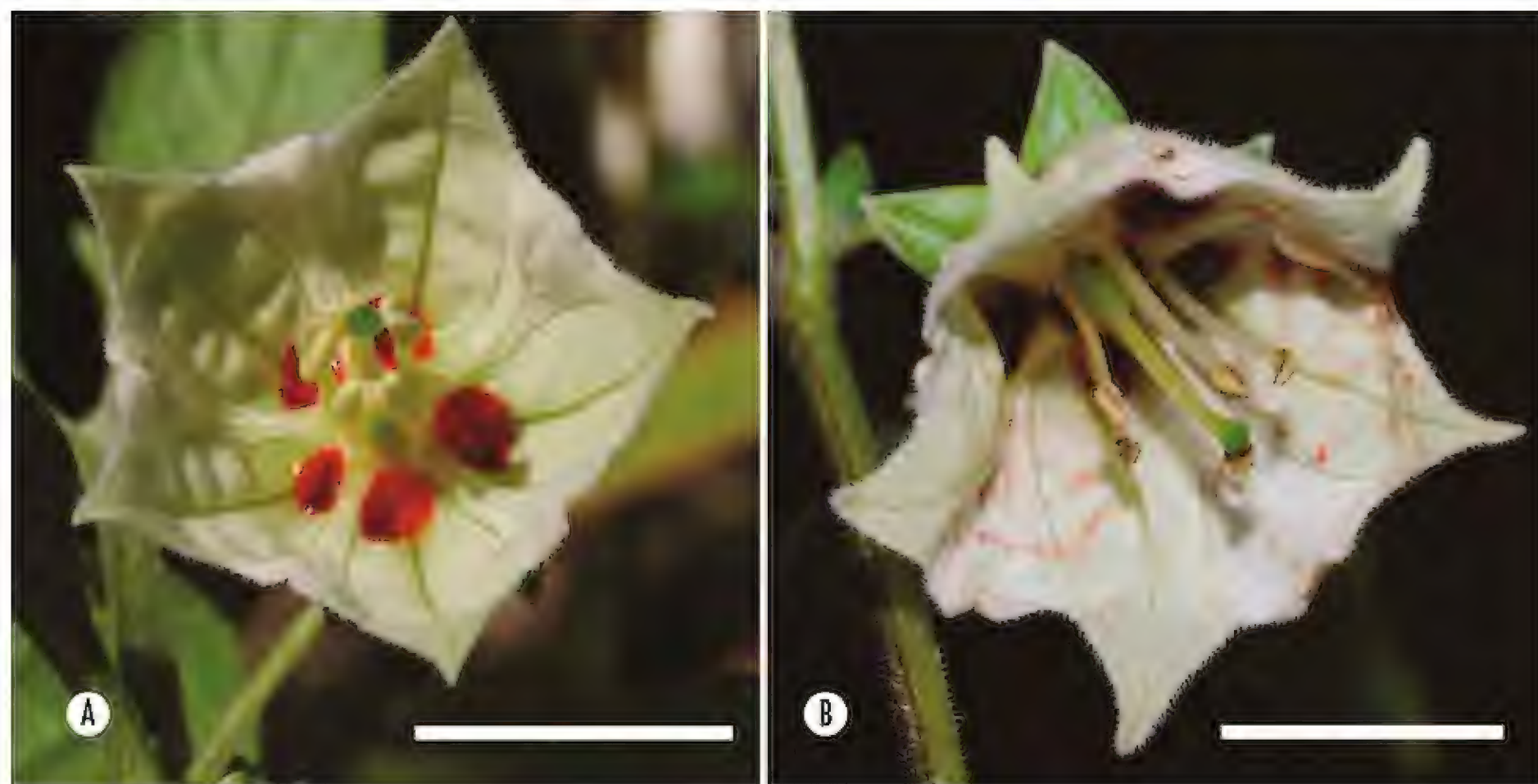
Figure 1. Protogyny of Jaltomata weigendiana . A. Pistillate phase (anthers undeheisced). B. Hermaphroditic phase (anthers dehiscent). Scale bars represent 1 cm. A. Cultivated plant, in sunlight, by Sara K. Popolizio. B. At the site of the type collection, with a flash, by T. M.

Inflorescence 1–2 flowered, corolla campanulate and green, lacking a corona, corolla limb and corolla lobules, radial staminal-corolla thickenings (five) creating nectar troughs (five) between the radial thickenings, the stigma capitate.